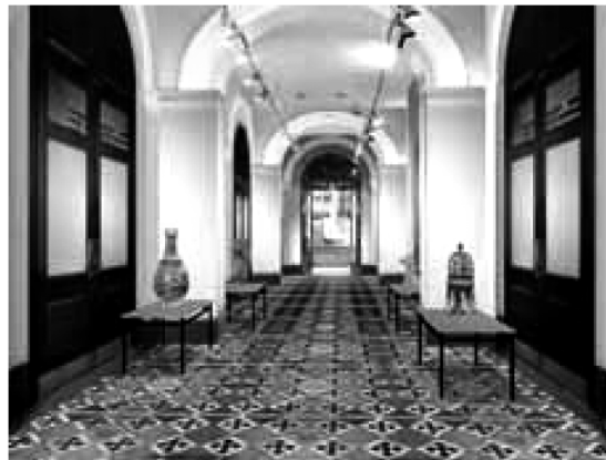
Fig. 1. Museum exhibition using VR.