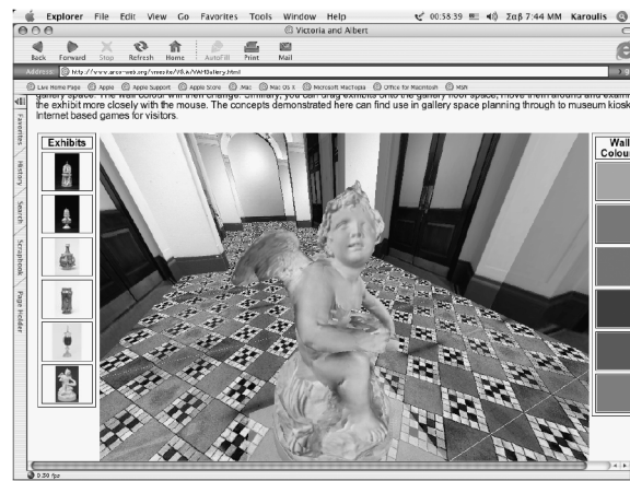
Fig. 3. An artifact in the AR interface.