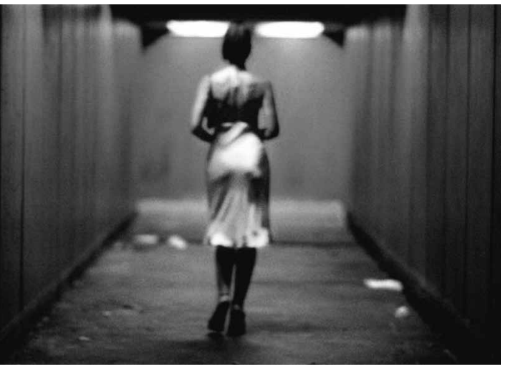
Still from Irréversible

"Let me commence with the following notice: there is no Truth in diagrams, nothing sacred in geometry... but there may be a diagram of a truth in some."