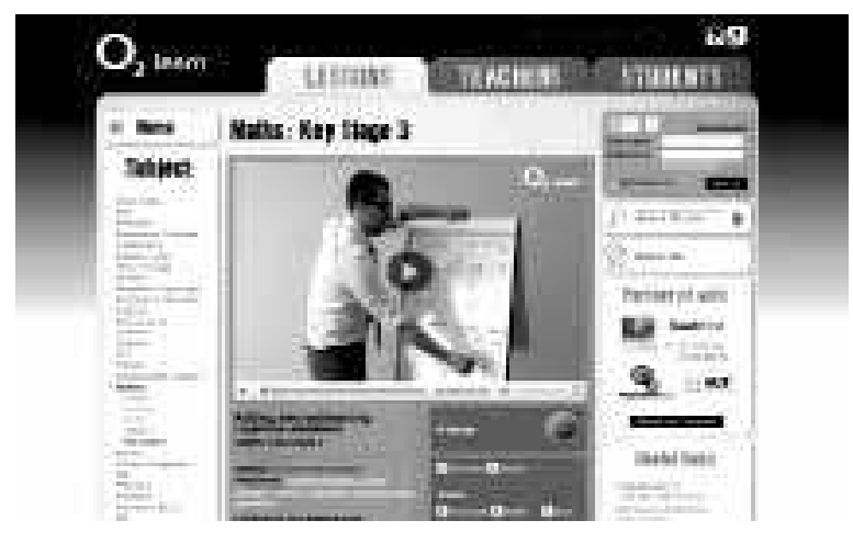
Figure 1: Exemplar lesson by O2 available via link from the Teach First web site

So whose interests are being served by current reforms? Although O2, as one of the private vested interests behind the charity Teach First, is making content freely available, what quality assurance system is in place for monitoring and evaluating the associated content and who pays for the download or access time? In the particular exemplar of a mathematics lesson provided by O2, it is difficult to see how this could be judged to be exemplary of good practice. Apart from questions of quality, it is also reflective of a simplistic view of lesson planning that is merely concerned with the 'how' of the situation, i.e. methods.