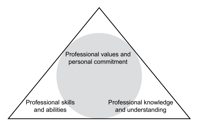
Figure 2 The inter-relationship among the three aspects which develops the professionalism of the teacher (GTCS, 2006)

There is a very close correspondence with the goals of the Swedish Higher Education Ordinance through the emphasis placed on professional values and personal commitment which is of particular relevance to the argument in this paper. Further the significance of placing these aspects within a triad is intended to emphasise that they are not simply lists of competencies or outcomes. Rather they are inherently linked to each other in the development of the teacher, and one aspect does not exist independently of the other two. It is this inter-relationship among all three which develops the professionalism of the teacher and leads to appropriate professional action. The inter-relationship is illustrated in the model below (Figure 2). What seems quite remarkable is the lack of correspondence with the narrowly conceived Scottish Credit and Qualifications Framework (SCQF).