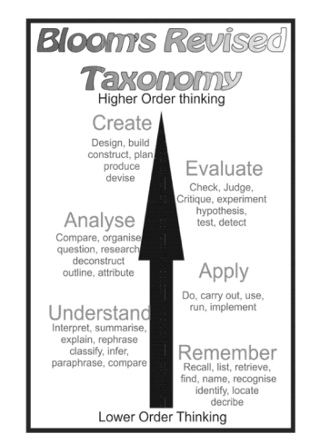
Figure 3 Bloom's revised "Digital" Taxonomy showing the flow and process of learning

The didactical design cycle starts from an emphasis on the What and Why questions which address questions of the significance and meaning for individual learners from the outset of the process of preparation for teaching, in contrast to the traditional objectified and instrumental approach of the instructional designers. This starts from an emphasis on didactical analysis through to a process of creative design which I believe is at the heart of the professional work of teachers. Accordingly, we can consider the process of Didactical Design in the form of a cyclical process of analysis, (creative) design, development, interaction and evaluation leading through to a subsequent process of re-design, as illustrated below in Figure 4.