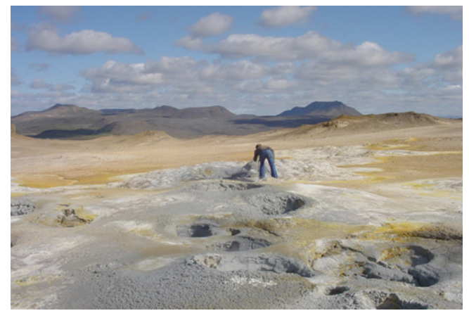
Figure 4: Recording volcanic bubbling clay pot

the 1950s in Paris. Schaeffer and others recorded sounds on tape, catalogued them in a complex system, and made systematic use of them in their compositions. In the 1980s digital samplers were introduced where people could record a sound and manipulate it digitally and control with digital interfaces. Together with these early explorations of the found sound and ever more sophisticated technology, the idea of using real world sounds in music became commonly accepted. But it took time for this to infiltrate into popular culture: just consider in this context the media attention in 1981 of the release of My Life in the Bush of Ghosts by Brian Eno and David Byrne or in 1998 when Matthew Herbert released his Around the House album (made of pure domestic sounds).