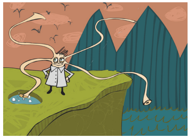
Figure 5: An artist illustration of "schizotopia" in SSBD

The sound sources of SSBD v.02 - Iceland are field recordings of Icelandic nature (geysers, hot springs, rivers, springs, ocean, wind, fire, birds, foxes, sheep, snow, ice, glaciers, rocks, etc.) recorded over a long period of time. In choosing the recordings we have deliberately excluded human noises, which was relatively easy as there was hardly any human noise in the remote places where the sounds were recorded. Our aim is to represent the natural soundscapes of the country in as many ways and combinations as possible and for that purpose the generative music format is ideal. The recordings serve as raw locations but in each performance of SSBD we get a unique fictional place, which could or could not possibly exist. The listener is situated in these locations with a binaural head that could or could not possibly exist, as the zooming into particular sounds and their subtle processing can be disproportionate to other sound origins. Not only is the head dispersed in space, but the sound sources themselves change locations gradually, creating the illusion of a levitation and movement inside the soundscape.