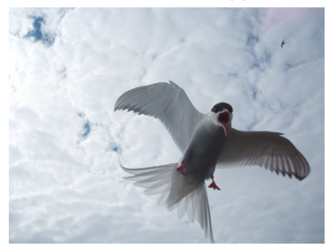
Figure 1: An arctic tern (Sterna Paridisaea) singing into the microphone on a summer day.

2003 in the form of a CD-Rom. Each version of the project deals with different subject matter, in this case field recordings from our native country, Iceland. The SSBD project is in version 3 at the moment, but we will focus on version 2 in this paper.