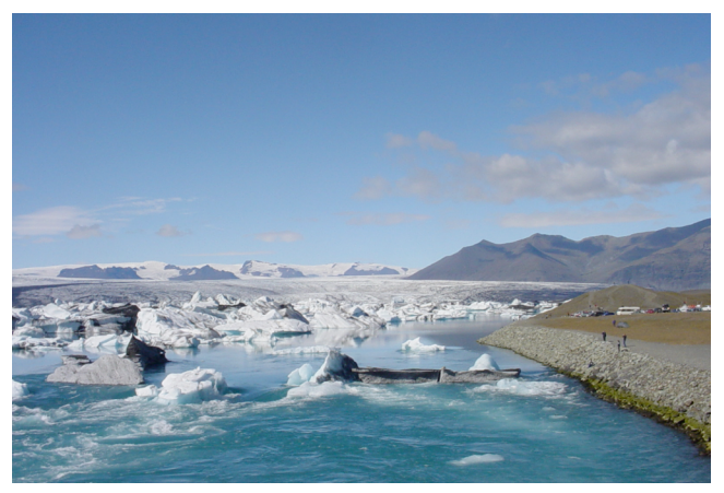
Figure 3: Ice and river sounds from the south of Iceland

In Western musical culture, the old mind/body dualism exhibits itself in the distinction between music as a score on the one hand and music as a performance through embodied and situated activity on the other. We have the intellectual system of notation and musical theory - the cerebral activity composing on paper versus the embodied activity of playing an instrument, where style is incorporated into the body through practice. This dualism has resulted in the kitschification of two roles: of the composer as a genius and the performer as virtuoso. The latter part of the 20<sup>th</sup> century saw an increasing focus on sound itself, the rejection of the institutional middle class music education, and emphasis on improvisation in musical performances. SSBD transcends the dualism mentioned above with its blurry conceptualization of authorship and performance: the focus is on sound and texture that is generated in real-time by interpreting instructions that are created partly by humans and partly by the machine.