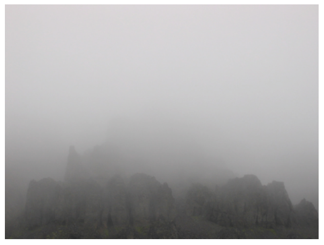
Figure 7: The fog silences the animals but not the water streams

Works of generative art can be written in any environment and distributed by any means. A programming language like C has an almost unlimited potential and portability. However, the biggest question for the artist is: what is the most efficient, quick and portable environment to make the work in? Higher level programming languages are better for development, but at the cost of less expressivity. Director and Flash are commercial coding and multi-media environments that have been popular with artists for years, but open source and cross platform environments such as Processing/Java, Python and Ruby are becoming ever more popular. In the world of sound, Pure Data, SuperCollider, ChucK and CSound are amongst the most expressive environments for generative composition and so is Max/MSP although that is closed source and commercial software.