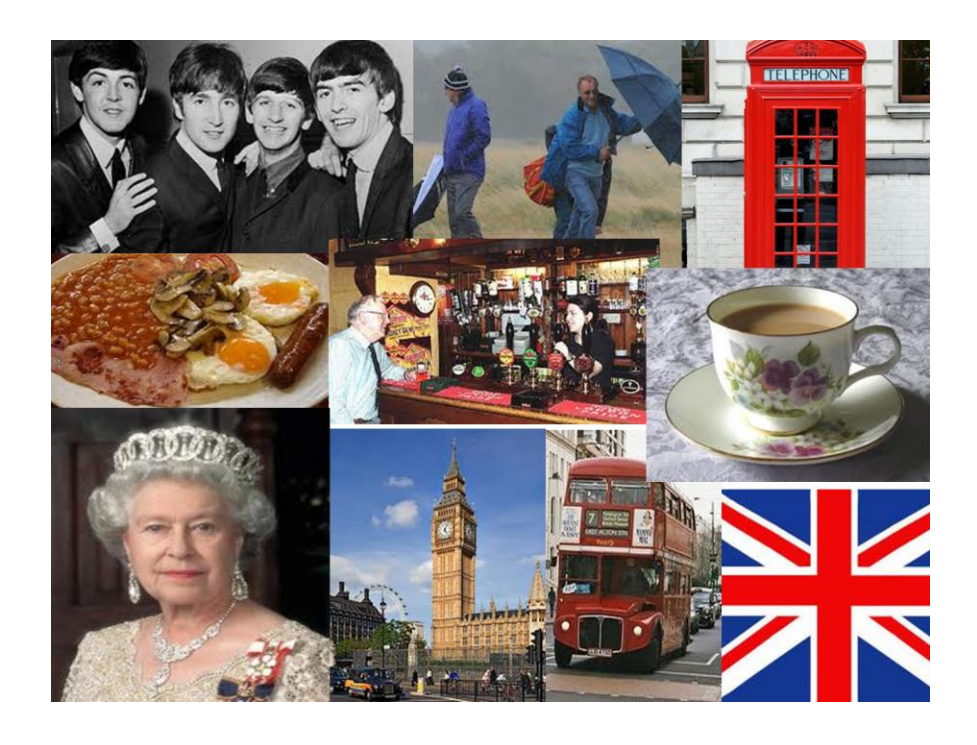
For an interesting alternative to these images of London, see <a href="http://shitlondon.co.uk/">http://shitlondon.co.uk/</a>!

These images were a result of word lists produced around the words 'French' and 'English'. The participants were Masters students at Nantes Science faculty, France. They were used to stimulate reactions from other participant groups. The PowerPoint of these images, as well as other associated documents can be found on my Sussex University online profile <a href="http://www.sussex.ac.uk/languages/people/list/person/305725">http://www.sussex.ac.uk/languages/people/list/person/305725</a> or I can email them to you.