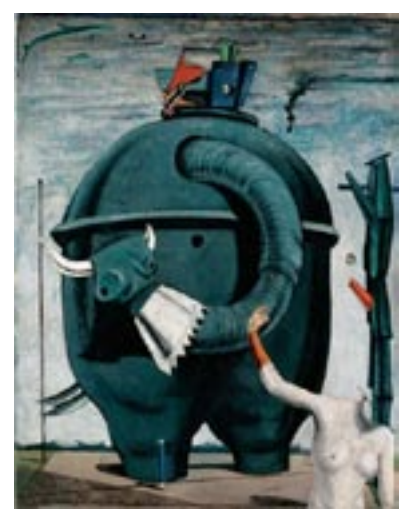
Figure 4. Max Ernst, Celebes, 1921

First, we can say that the painting gives the encounter with the lived abnormal body of the Contergan woman a context by way of horizon. Uniquely, the woman blends into the painting as it—the painting—creates a sense of indifferent dehumanizing environment, an environment, where the human body is dulled, robbed of