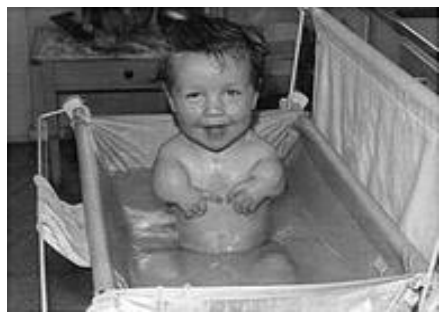
Figure 2. Contergan Baby

severe cases, no inpatient medical aid had been required for the Contergan population, only general, albeit involved, home care.<sup>1</sup> Those medical specialists who came to research Contergan in the wake of this social drama noticed that Contergan's abnormality did not connote debilitation but has a productive, generative facet; it