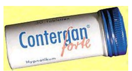
Figure 1. Contergan Hypnotikum

appearance broke any and every anticipation of an embodied human being. The person "stood" next to Ernst's painting "The Teetering Woman." The person's face, haircut, and clothes indicated the female gender. I could guess her age as being about forty years old. Sunk deeply into the electrical chair, the woman was holding an audio-guide in her toes, bending toward it for better hearing. She had no arms and used her naked feet to adjust her child-like body to change the field of vision. Judging by the apparent ease with which she moved herself in the chair and, simultaneously, moved the chair, her comportment was unreflectively habitual to her; no noticeable disjunction of motility could be detected. After the guided message ended, the woman put the recorder in her lap, and, with the help of her feet, pulled herself up. Then, the short stub of her right shoulder touched the control lever and rolled the chair to the next painting. As she moved further away, I heard someone behind me whisper, "Contergan." I inquired. The results of that inquiry were various medical, social, and psychological consequences of the condition known as Contergan. Briefly, Contergan is a specific condition caused by the drug "Contergan" that contains the active substance