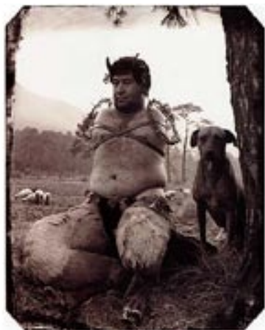
Figure 5. Joel-Peter Witkin, 1992, Satiro

mal in the sphere of surreal. Below I would like to present an example that derives from that sphere.