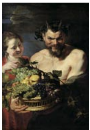
Figure 6. Paul Rubens, Satyr, 1615, Satyr with Maid and Fruit Basket

In the 1990 photograph called "Satiro" Witkin bedazzles the viewer with an uncanny creature (see Figure 5). The creature is a man without arms but with colossal legs of a goat, or horse, just like any other Satyr. A mythological demi-God, or forest God, Satyr is a creature as mischievous as it is powerful. He keeps company with Nymphs, bestowing the art of seduction on both men and animals. Satyr's massive legs allow him to overcome galloping horses, while the mighty arms give him