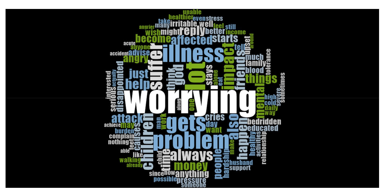
Fig 2. Word cloud of terms used by caregivers in relation to the theme of emotional impact.

https://doi.org/10.1371/journal.pntd.0007487.g002