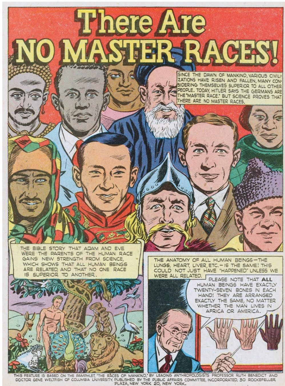
Figure 3.1. "Since the dawn of mankind," There Are No Master Races! , 1. New York: The Public Affairs Committee, Inc., 1944. Print. American Jewish Committee Archives, New York.