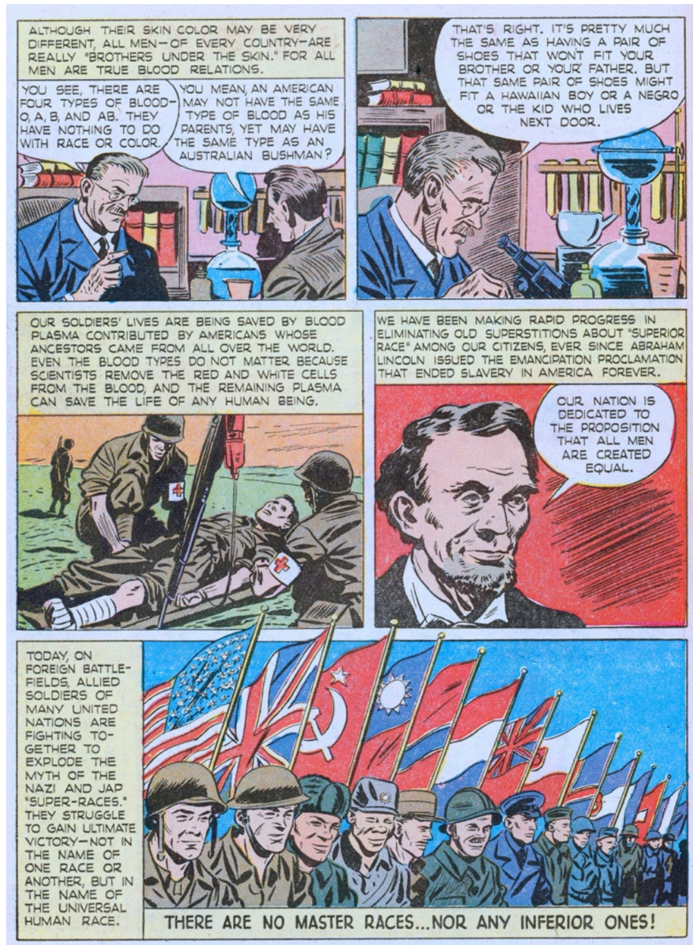
Figure 3.3. "Brothers under the skin," There Are No Master Races! , 7. New York: The Public Affairs Committee, Inc., 1944. Print. American Jewish Committee Archives, New York.