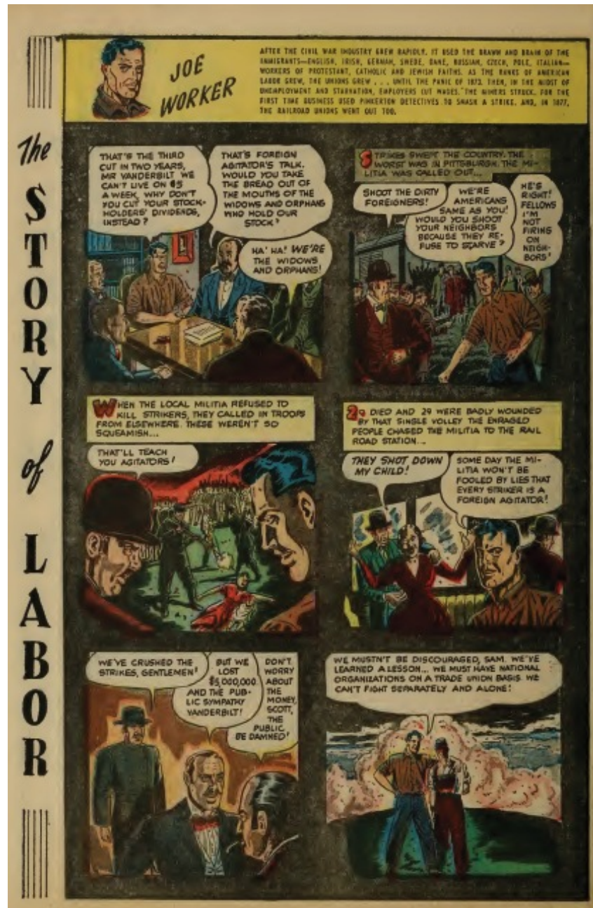
Figure 4.4. Nat Schachner and Jack Alderman, "The 1877 Railroad Union strike," The Story of Labor , 12. New York: National Labor Service, n. d. [1946]. Print. American Jewish Committee Archives, New York.