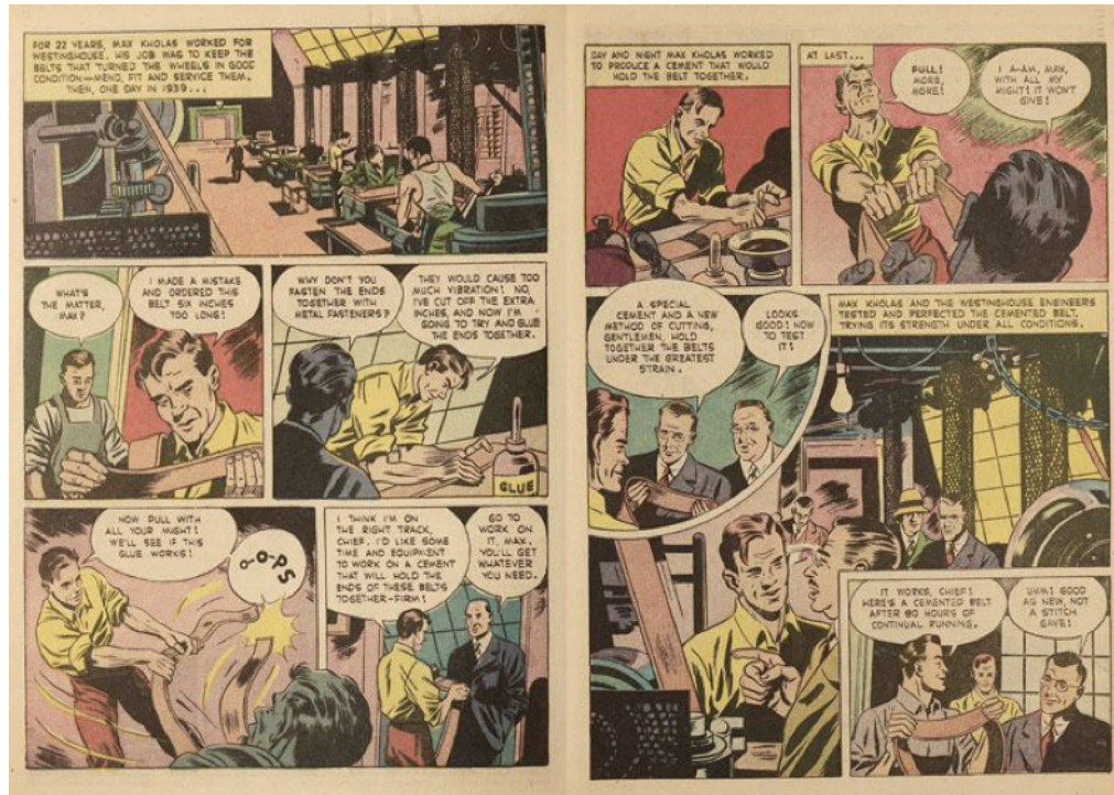
Figure 2.10. "One day in 1939 . . .," Extra Effort , 2-3. New York: War Services Division of the Parents' Institute, 1942. Print. American Jewish Committee Archives, New York.