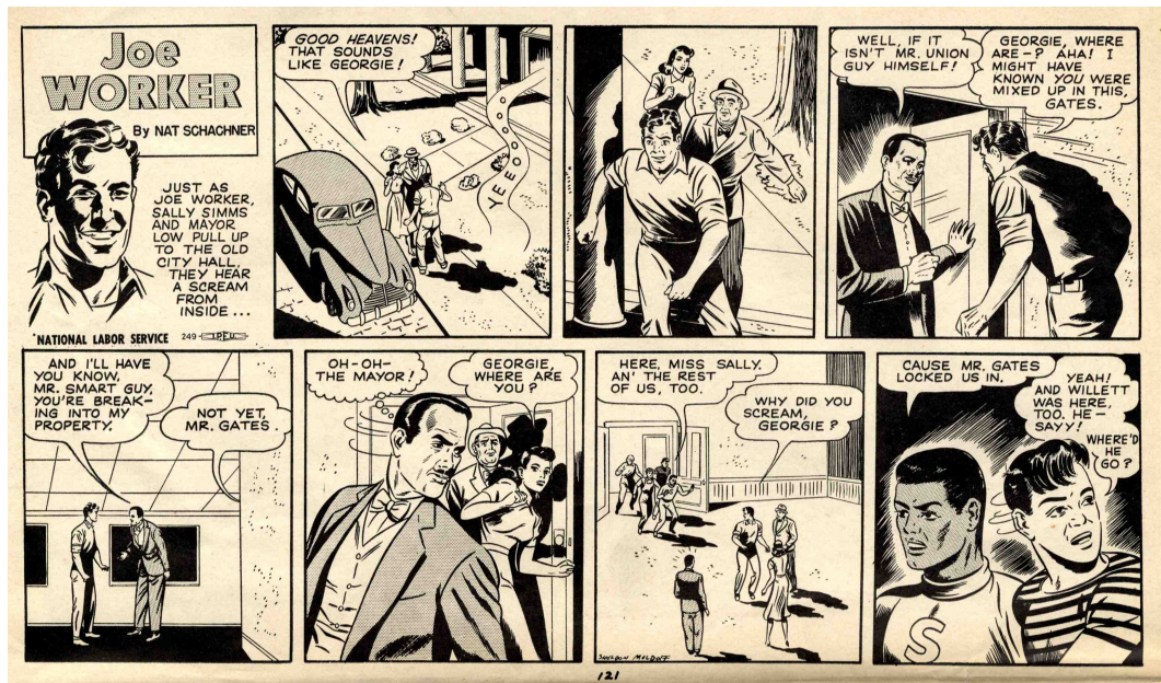
Figure 4.13. Nat Schachner and Sheldon “Shelly” Moldoff, “Georgie Brown and Sammy Epstein,” Joe Worker #121. New York: National Labor Service, n. d. [1948]. Print. American Jewish Committee Archives, New York.