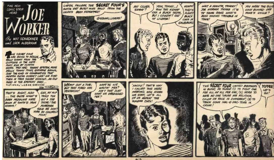
Figure 4.11. Nat Schachner and Jack Alderman, "The Secret Four," Joe Worker #13. New York: National Labor Service, n. d. [1946]. Print. American Jewish Committee Archives, New York.