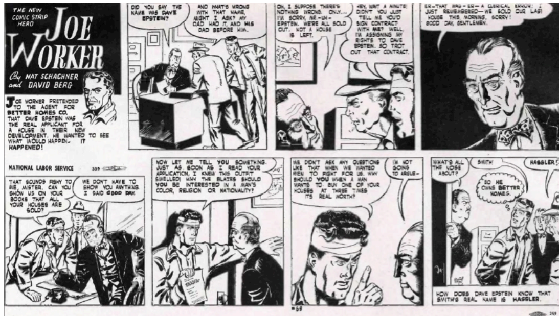
Figure 4.7. Nat Schachner and David Berg, “Better Homes Co.,” Joe Worker #68. New York: National Labor Service, n. d. [1947]. Print. American Jewish Committee Archives, New York. Source: NLS, AJCA, http://www.ajcarchives.org/main.php?GroupingId=3400 .

Image courtesy of the American Jewish Committee Archives, New York.