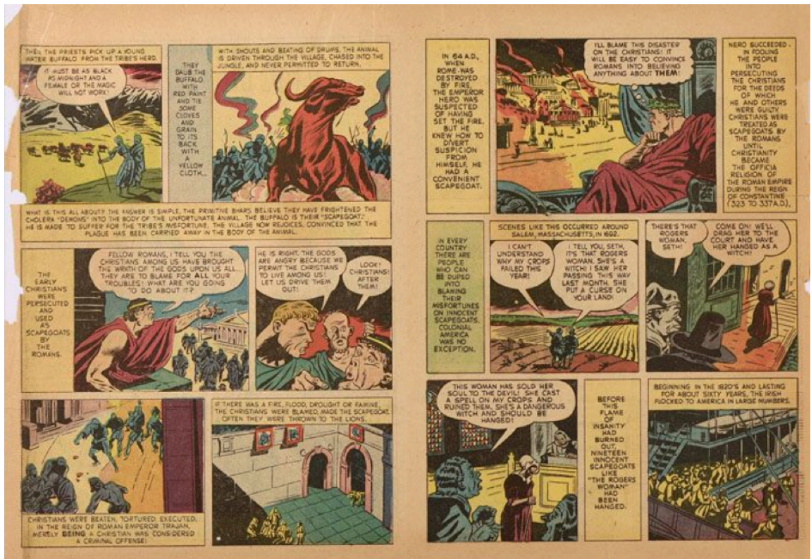
Figure 3.7. "Scapegoats in history," They Got the Blame , 2-3. Young Men's Christian Association, 1942. Print. American Jewish Committee Archives, New York.