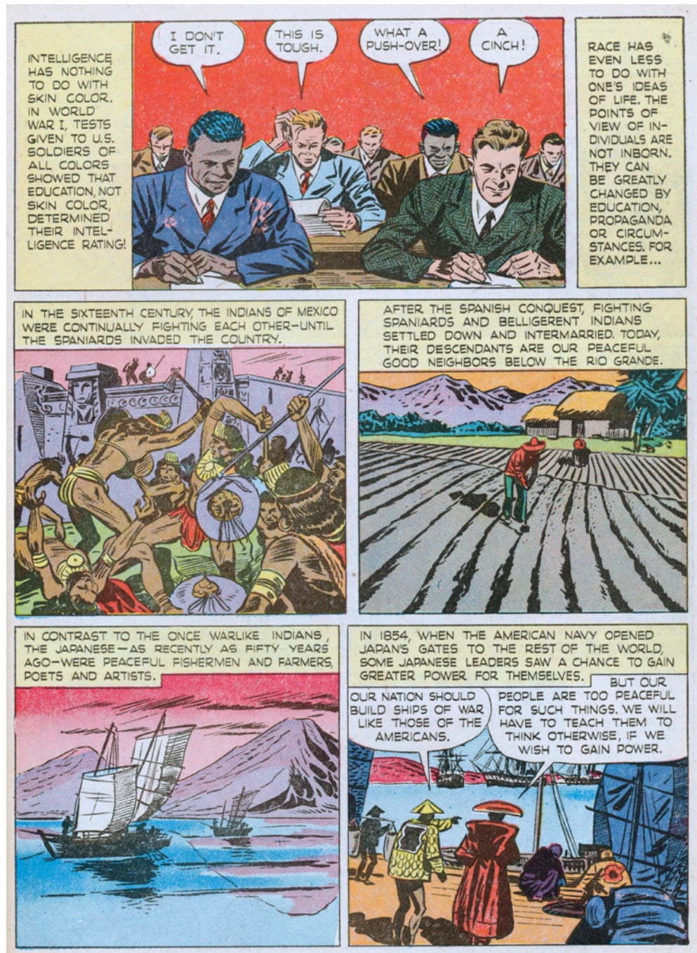
Figure 3.4. "Intelligence," There Are No Master Races! , 4. New York: The Public Affairs Committee, Inc., 1944. Print. American Jewish Committee Archives, New York. Restored image source: Out of This World, http://kb-outofthisworld.blogspot.co.uk/2011/04/anti-racist-propaganda-in-comics-true.html .

Image courtesy of Out of This World and the American Jewish Committee Archives, New York.