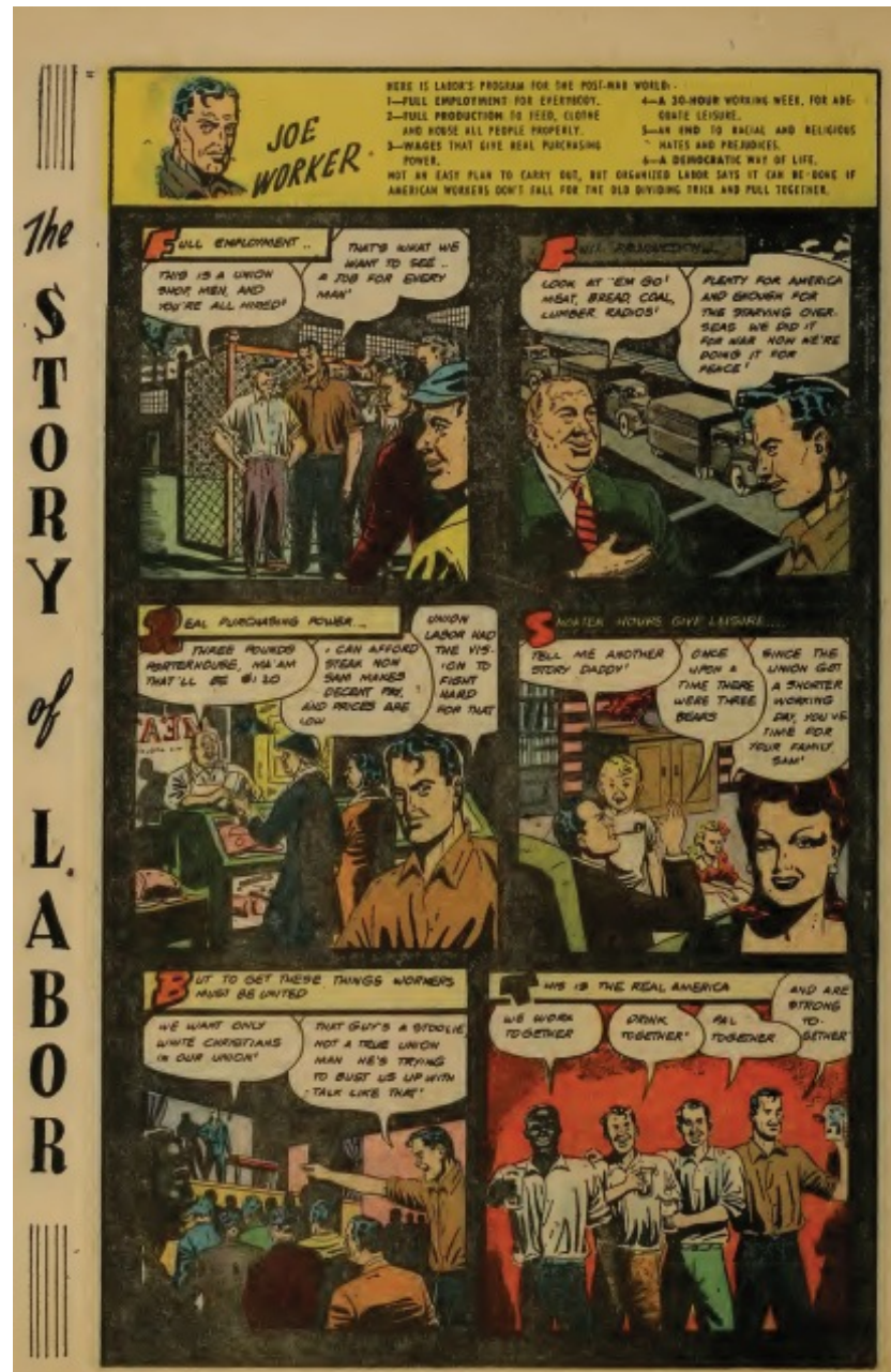
Figure 4.5. Nat Schachner and Jack Alderman, "Labor's program for the post-war world," The Story of Labor , 46. New York: National Labor Service, n. d. [1946]. Print. American Jewish Committee Archives, New York.