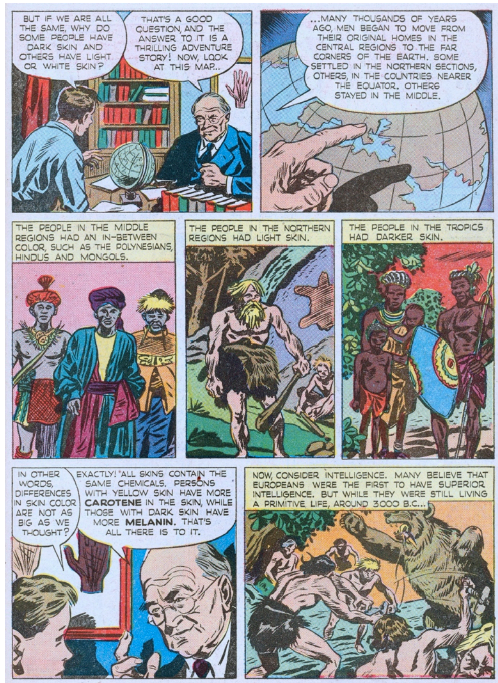
Figure 3.2. "All skin contains the same chemicals," There Are No Master Races! , 2. New York: The Public Affairs Committee, Inc., 1944. Print. American Jewish Committee Archives, New York.