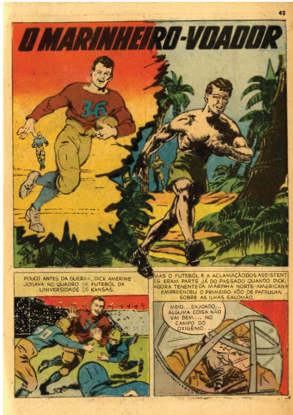
Figure 2.2. “O Marinheiro-Voador,” Heróis Verdadeiros , 45. [Office of Inter-American Affairs, 1943]. Print. American Jewish Committee Archives, New York.