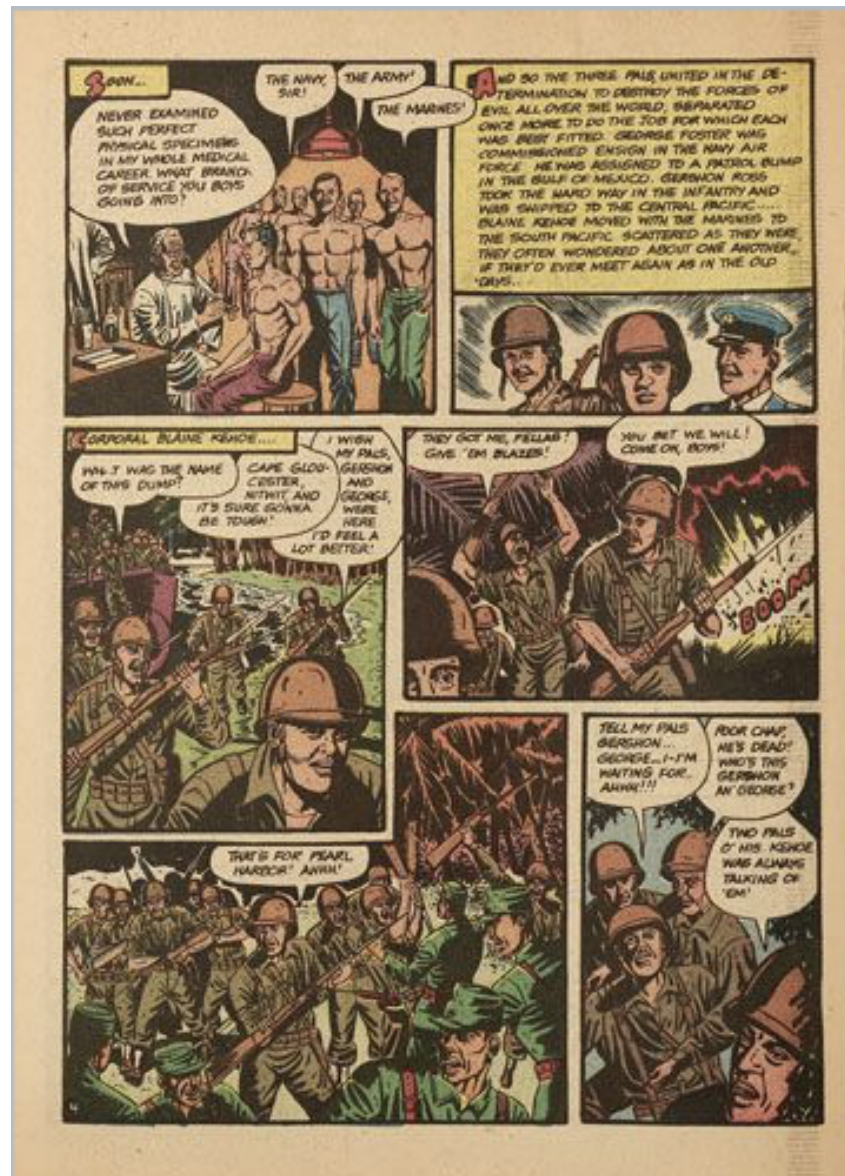
Figure 2.3. Jack Alderman, "Medical Examination," Three Pals , 4. New York: Community Service, n. d. [1945]. Print. American Jewish Committee Archives, New York.