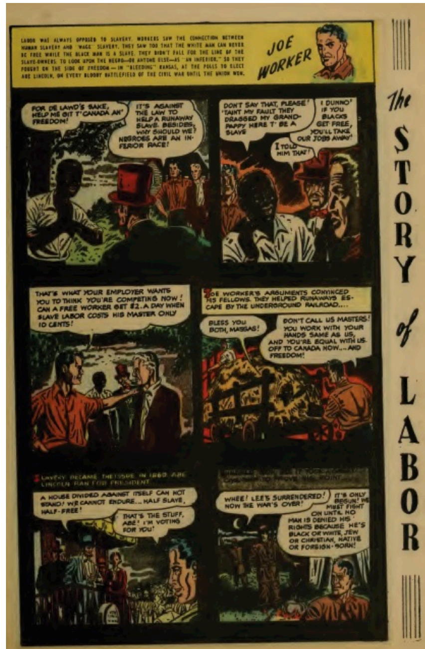
Figure 4.3. Nat Schachner and Jack Alderman, "Slave labor," The Story of Labor , 11. New York: National Labor Service, n. d. [1946]. Print. American Jewish Committee Archives, New York. Source: IA, http://ia600300.us.archive.org/21/items/joeworkerstoryof00scha/joeworkerstoryof00scha.pdf .

Image courtesy of the Internet Archive and the American Jewish Committee Archives, New York.