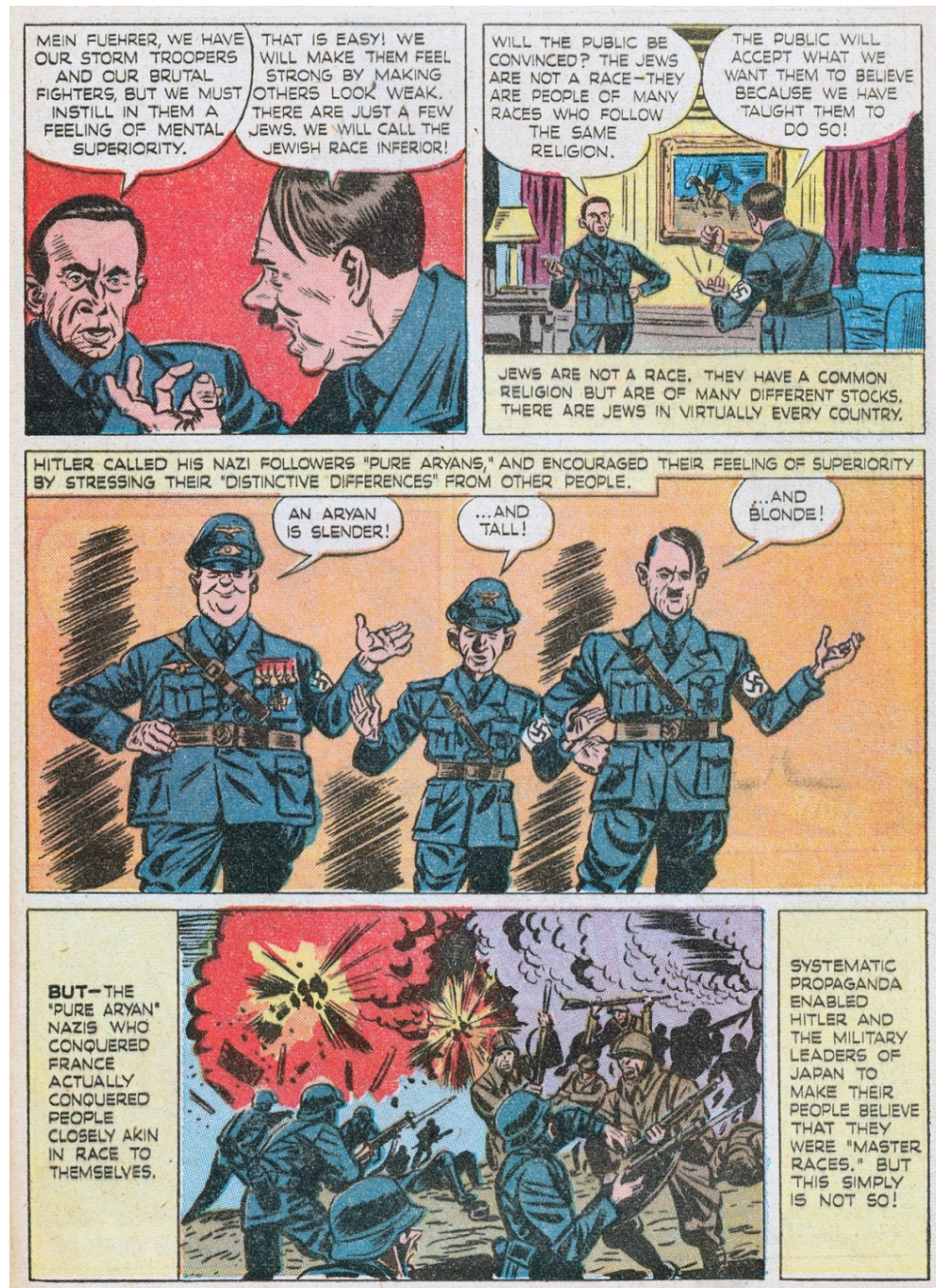
Figure 3.9. "Pure Aryans," There Are No Master Races! , 6. New York: The Public Affairs Committee, Inc., 1944. Print. American Jewish Committee Archives, New York.