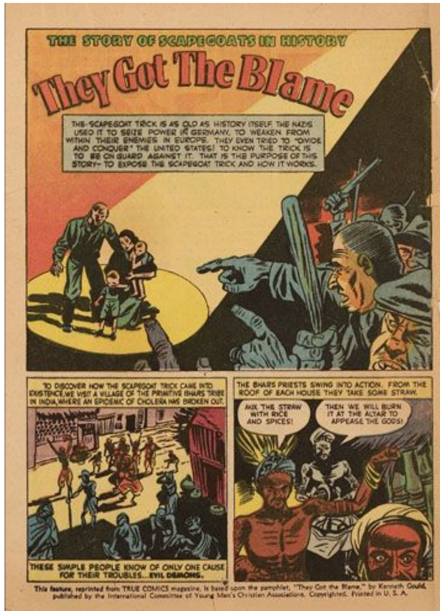
Figure 3.6. "The scapegoat trick," They Got the Blame , 1. Young Men's Christian Association, 1942. Print. American Jewish Committee Archives, New York.