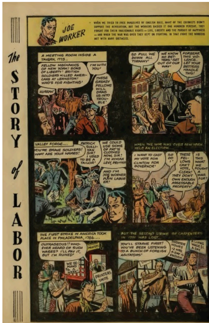
Figure 4.2. Nat Schachner and Jack Alderman, "Revolutionary War," The Story of Labor , 6. New York: National Labor Service, n. d. [1946]. Print. American Jewish Committee Archives, New York.