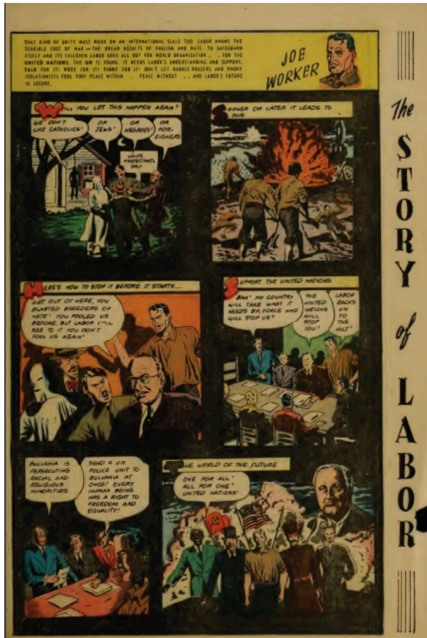
Figure 4.10. Nat Schachner and Jack Alderman, "Will you let this happen again?," The Story of Labor , 47. New York: National Labor Service, n. d. [1946]. Print. American Jewish Committee Archives, New York.