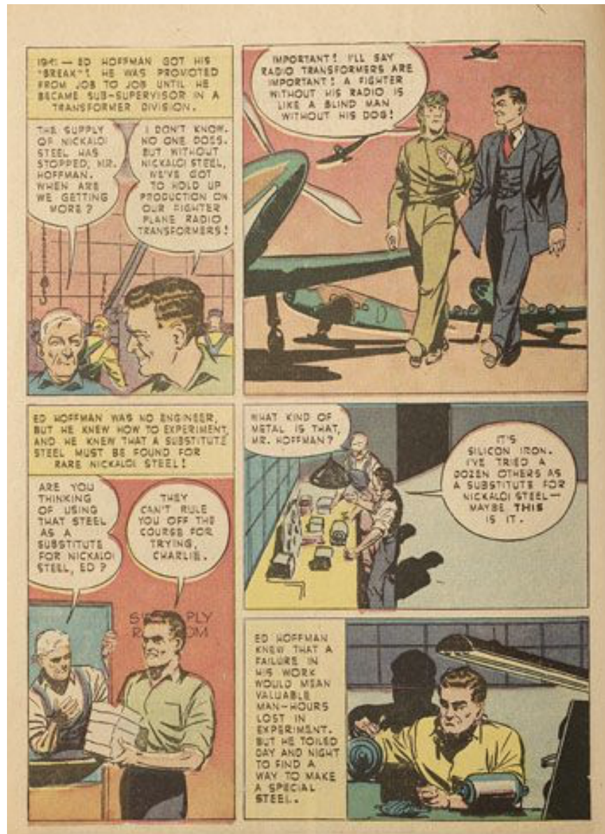
Figure 2.8. "The transformer division," Extra Effort , 6. New York: War Services Division of the Parents' Institute, 1942. Print. American Jewish Committee Archives, New York.