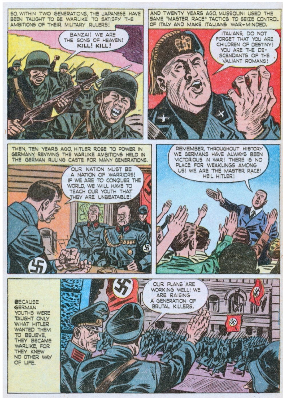
Figure 3.5. "War-minded peoples," There Are No Master Races! , 5. New York: The Public Affairs Committee, Inc., 1944. Print. American Jewish Committee Archives, New York.