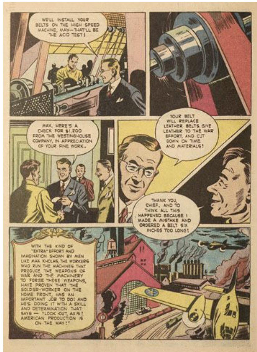
Figure 2.9. "Look out Axis! American production is on the way!," Extra Effort , 4. New York: War Services Division of the Parents' Institute, 1942. Print. American Jewish Committee Archives, New York. Source: SC, AJCA, http://www.ajcarchives.org/main.php?DocumentId=1690 .

Image courtesy of the American Jewish Committee Archives, New York. © 1942 by The War Services Division of the Parents' Institute.