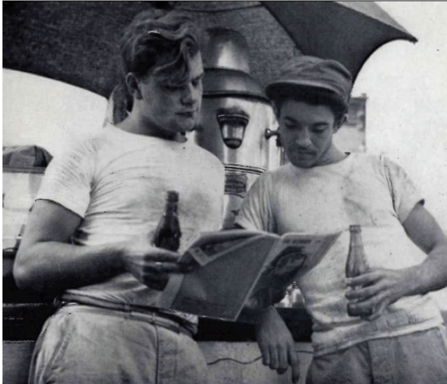
Figure 4.1. National Labor Service, “Workers reading Joe Worker and the Story of Labor ,” detail from Working for Labor: the Story of the National Labor Service , 9. New York: National Labor Service, n. d. [1946]. Print. American Jewish Committee Archives, New York.