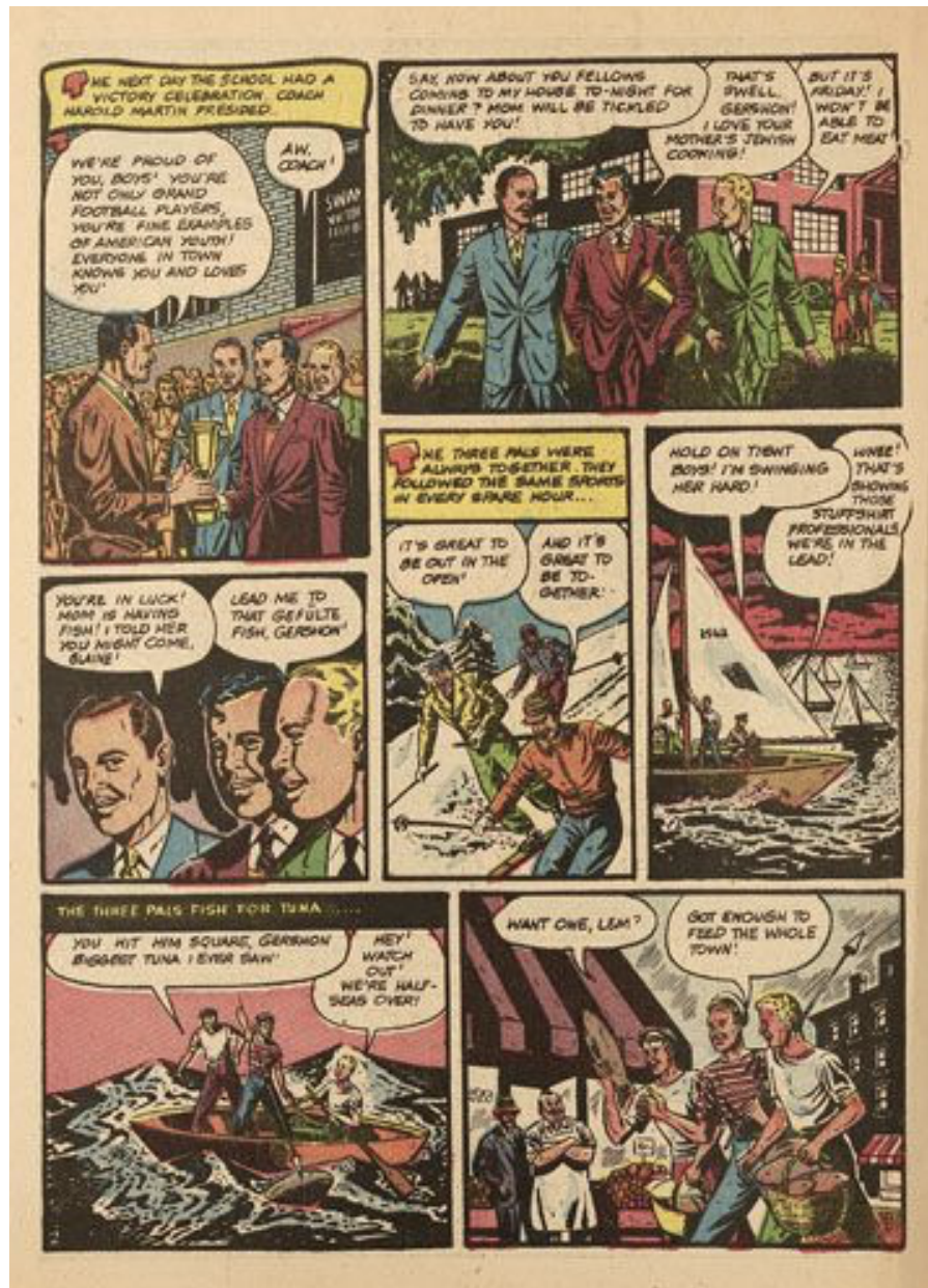
Figure 2.4. Jack Alderman, "Winning the football cup," Three Pals , 2. New York: Community Service, n. d. [1945]. Print. American Jewish Committee Archives, New York.