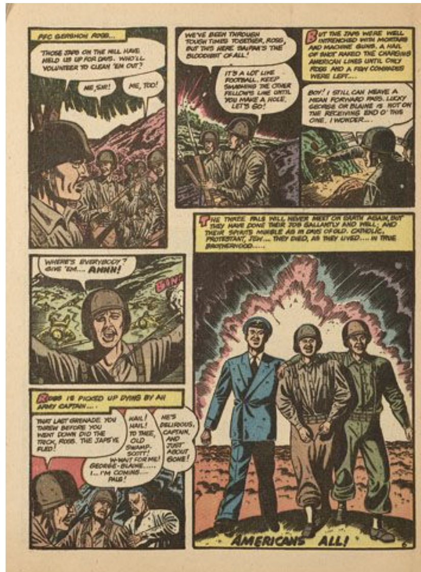
Figure 2.5. Jack Alderman, "Americans All!," Three Pals , 6. New York: Community Service, n. d. [1945]. Print. American Jewish Committee Archives, New York.