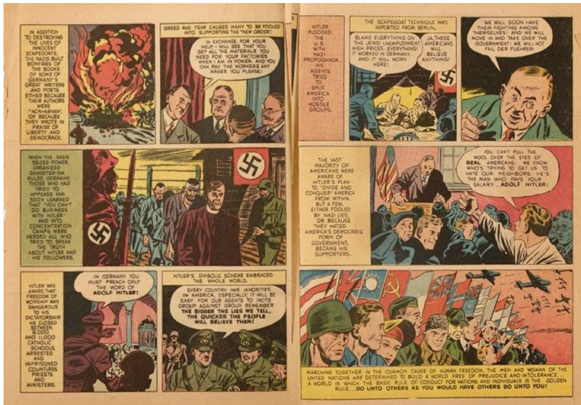
Figure 3.8. "A world free of prejudice and intolerance," They Got the Blame , 6-7. Young Men's Christian Association, 1942. Print. American Jewish Committee Archives, New York. Source: SC, AJCA, http://www.ajcarchives.org/main.php?DocumentId=1720 .

Image courtesy of the American Jewish Committee Archives, New York. © 1944 by unknown.