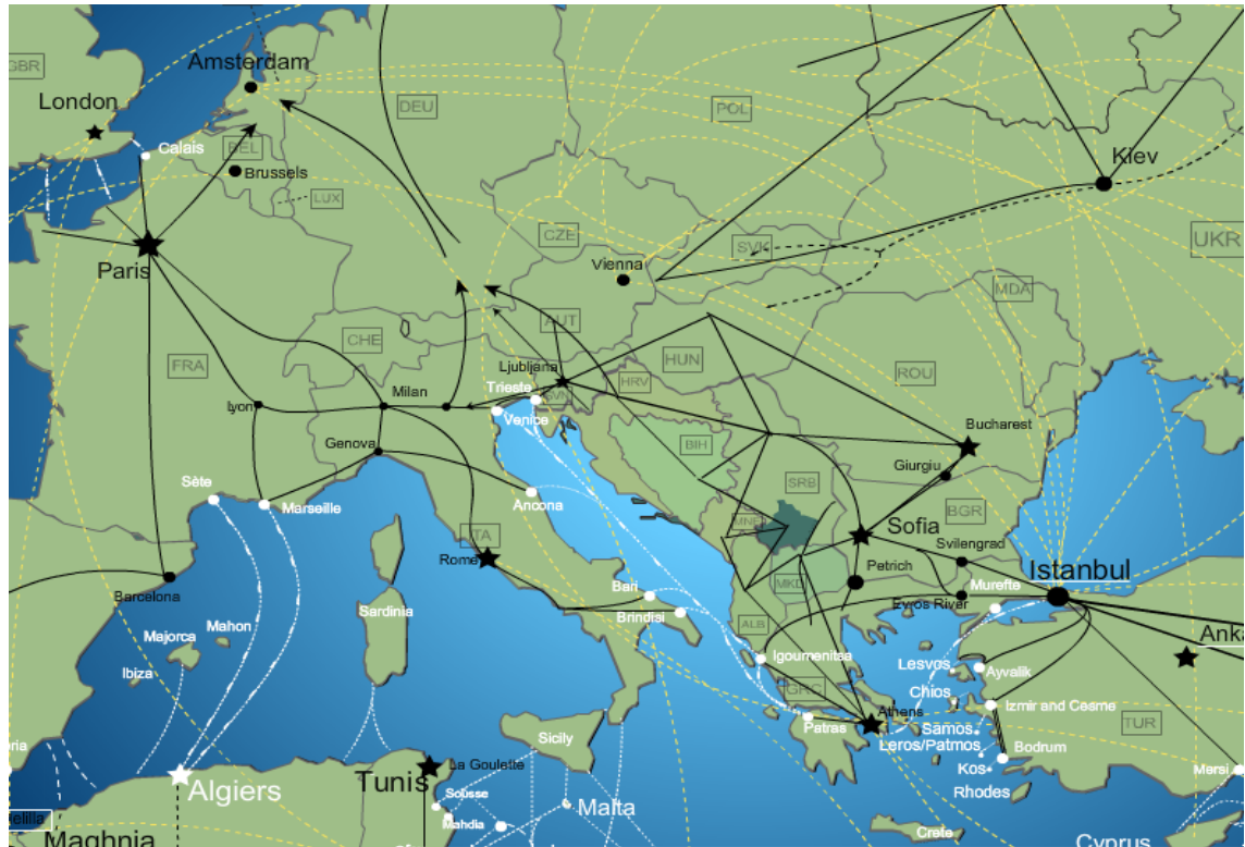
Map 1: Routes of Irregular Migration to Europe