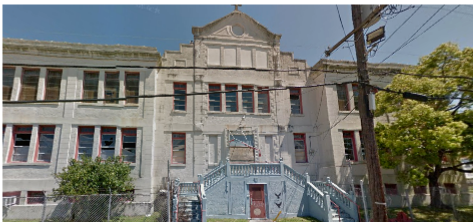
Corpus Christi School, view from Onzaga street (March 2014) 391