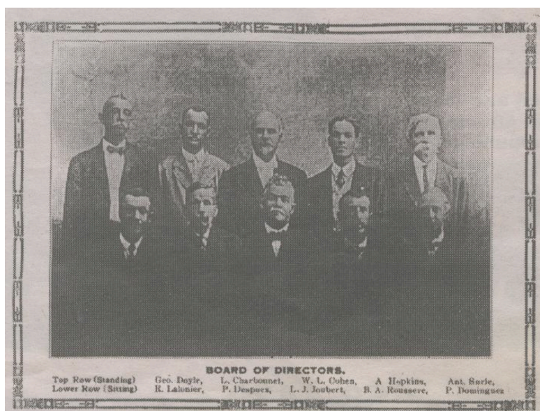
Board of Directors of the Couvent School, 1917 364