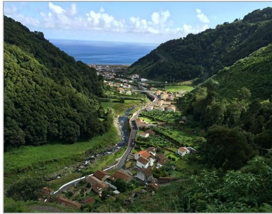
Figure 5.2 Images of the 'Azorean rural idyll' At the top: Faial Island; at the bottom: São Miguel Island