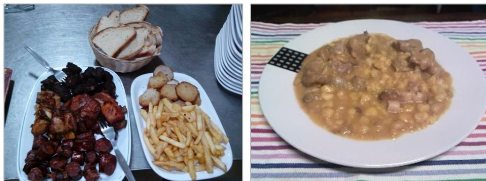
Figure 7.5 Typical Cape Verdean food at Yolanda's restaurant

On the left: traditional sausages and fried yam; on the right: 'cachupa'