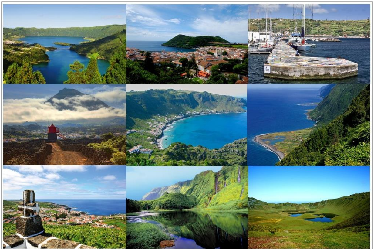
Figure 3.2 Images of the Azores islands

Starting from the upper left corner and following by rows: Lagoa das setes cidades ('lagoon of the seven cities'), São Miguel Island; view over the city of Angra do Heroísmo, Terceira Island; Horta marine, Faial Island; view over the vineyards and Pico mountain, Pico Island; São Lourenço bay, Santa Maria Island; Fajã of Santo Cristo ('Holy Spirit strip'), São Jorge Island; Nossa Senhora da Ajuda ('Holy Mary') belvedere, Graciosa Island; waterfalls of Poço da Alagoinha ('well of the little lagoon'), Flores Island; Caldeirão ('cauldron'), Corvo Island.