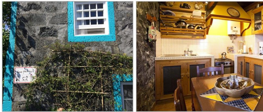
Figure 7.3 Homes renovated by migrants

On the left: Elena's casa paraíso [paradise home]; on the right: Lucília's renovated cottage