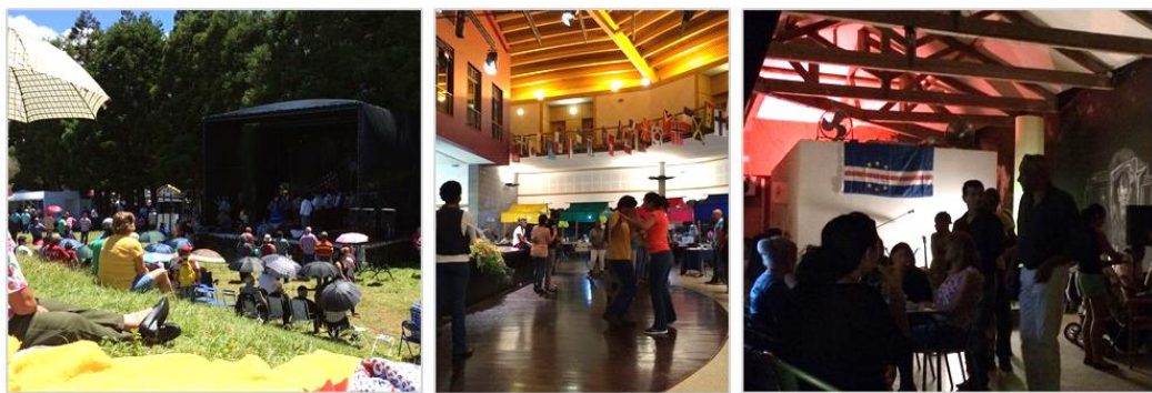
Figure 4.3 Events attended in the Azores

photographs 43 , relevant newspaper articles from the local media, participant observation, and a focus group with key local actors. I also took part in local events and celebrations involving the study groups. This included large Azorean religious celebrations such as Festas do Divino Espírito Santo [Holy Ghost Festival], smaller events such as Dia do Emigrante [Emigrant Day] in Terceira island and Dia do Imigrante [Immigrant Day] in Terceira and São Miguel Islands, and other local festivities (e.g. the running of the bulls, and the parade in the Praia da Vitória, Terceira island) and kermesses to celebrate religious events in the various parishes of the islands (figure 4.3).