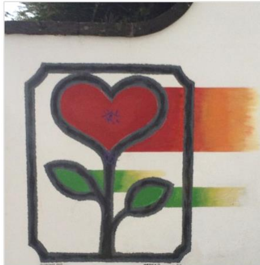
Figure 7.2 Vince's art work

This [the book] was to promote the Island. We love the Island. People can see what they can do here. The past must be accepted, they killed whales to survive. We also eat meat and kill animals. We celebrate the islands through pictures, showing that the Azores is a special spot with history.