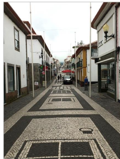
Figure 4.2 The Azores over summer and winter

On the left: Holy Ghost Festival in Ponta Delgada, São Miguel Island, in July 2014; on the right: one of the main streets of Praia da Vitória, Terceira Island, in October 2014.