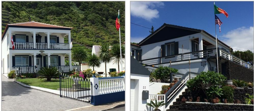
Figure 5.3 Azorean homes symbolically displaying the family's past of emigration On the left: Canadian and Portuguese flags and the Northern goshawk, the main symbol of the Azores flag, inscribed at the top of the house's entrance; on the right: United States and Portuguese flags hierarchically positioned with the flag of the homeland displayed on top of that of the emigration country.

Material, but also emotional and symbolic forms of transnationalism, come out in different ways in the participants' narratives. For some interviewees, and in many other 'anonymous' homes across the Azores, the symbolism of the two flags – the Portuguese, often the Azorean, and that of the country of emigration – displays mixed affiliations and affections, acting also as a statement of social status within the community (figure 5.3).