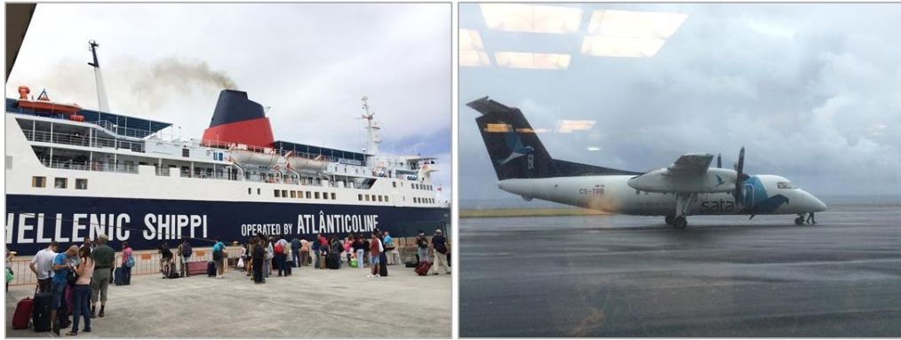
Figure 4.1 Travelling between islands

On the left: in Terceira Island waiting for the ferry to São Miguel Island, an over three hours journey; on the right: in Faial Island waiting to board to São Miguel Island after my flight had been delayed due to bad weather conditions.