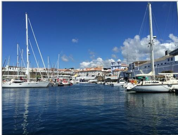
Figure 6.2 Flip's home: the symbolism of freedom

(Klara and Wolfgang, LF early 50s/mid-70s, Germany, 1998)