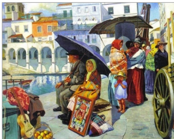
Figure 3.3 'Os Emigrantes' [Emigrants] by Domingos Rebelo (1926)