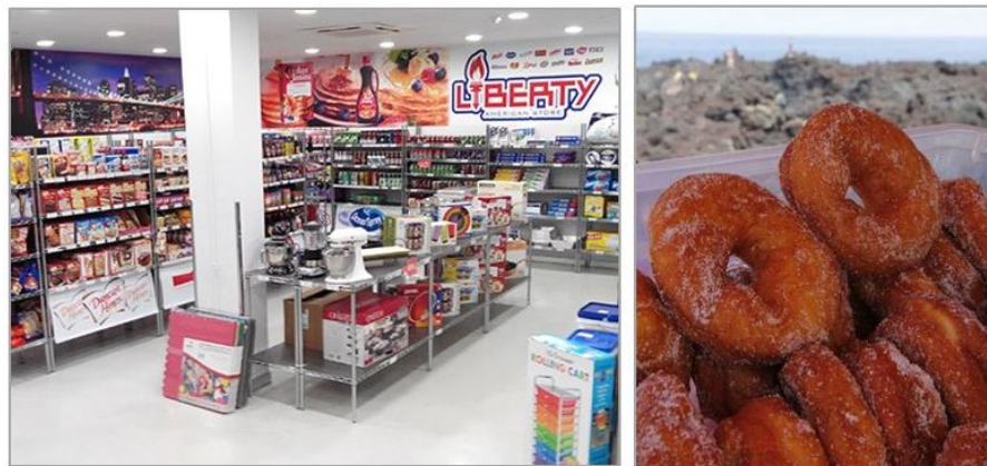
Figure 5.4 American (-influenced) foods

(Emília, R late 50s, United States, 1985)