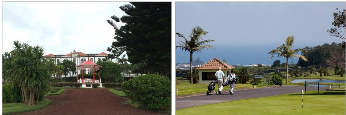
Figure 6.1 Spaces of social living

Among the participants who returned, there is a 'quest for anchorage' (Corcoran, 2002), a feeling normally heightened over the life course. The fact that return to the Azores is often carried out as a family project tends to ease the transition back to the homeland, therefore avoiding feelings of loneliness and social isolation. However, even in cases in which participants returned alone, as in Silvina's case, neighbours and relatives on the islands naturally play a re-integrating and accompanying role, especially for the oldest migrants.