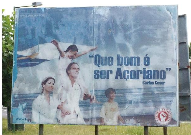
Figure 3.4 'Que bom é ser Açoriano' [It's good to be Azorean]

According to the author, this cultural revival, resulting from media and institutional manoeuvring of cultural identities, was thought to benefit the home country through remittances and investments and by indirectly inviting a potential return 'home'. Also at the island level, it is possible to find politically-driven appeals to the Azorean identity and the pride of being Azorean (figure 3.4). Rather than a clear appeal to return (which is indeed unlikely for many Azorean emigrants due to family and economic reasons), these campaigns seem to aim at strengthening the regional identity and the links between the Azoreans on the islands and those in the diaspora.