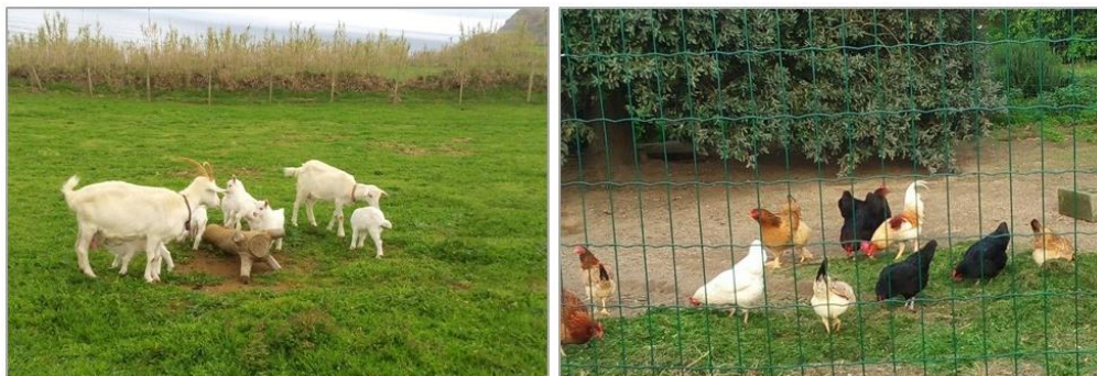
Figure 7.4 Animals in Domenico and Gaetana’s farm

Although diluted over time, the effects that return migrants had on the islanders’ diet were more widespread and noticeable. Specifically, this represented a tremendous