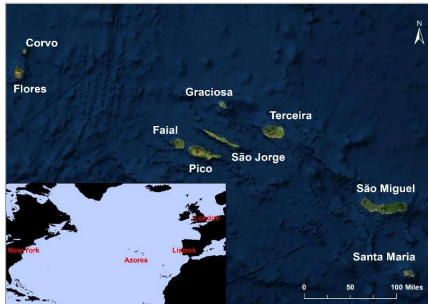
Figure 3.1 Map of the Azores